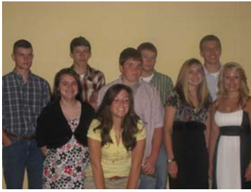
(pictured members of the Senior Team)