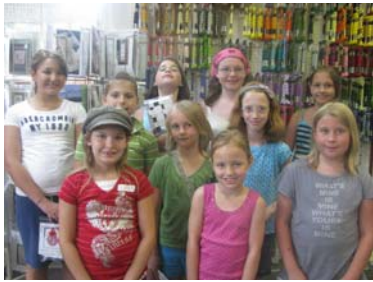
Pictured are participants in the needle work project day on June 22 nd .