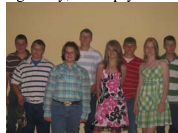
(pictured members of the Intermediate Team)