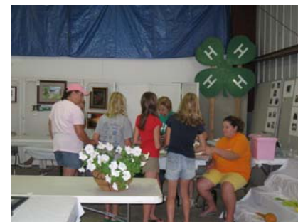
Taking entries at the Exhibit Hall on Entry Day.