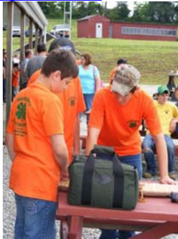
Pictured is Spencer County Shooting Members preparing for competition.