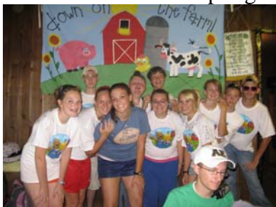
Pictured are the Teen Counselors from Spencer County

A great week was had by all. Spencer County will be going to camp in 2010, so if you are interested please contact the Extension Office for additional information next spring.