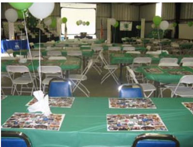
Setup of the 2008 Banquet

Please RSVP by September 11 th to 477-2217 with the total number of people that will be attending the Banquet.