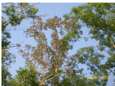
Figure 3. White oak tree, in center of photo, showing browning of foliage caused by oak anthracnose.