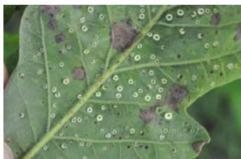
Figure 6. Light green developing galls, small dark spots are scars from fallen galls, larger dark areas are reactions to gall attachment.

Jumping oak galls, made by tiny non-stinging wasps, are causing white oak leaves to turn brown and drop off in some areas. The brown to black spots on leaves are discolorations that a gall creates on the upper leaf surface.