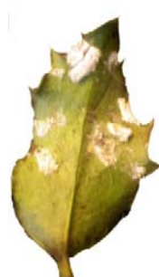
Figure 7. Camellia scale egg sacs on underside of holly leaf.

Cottony egg sacs of the camellia scale have been a common sight on holly so far this spring. This soft scale reportedly also attacks Taxus, camellia, rhododendron, Japanese maple, English ivy, and mulberry. These sacs contain large numbers of eggs that are hatching now. This is important to know because the small crawler stage is susceptible to control by