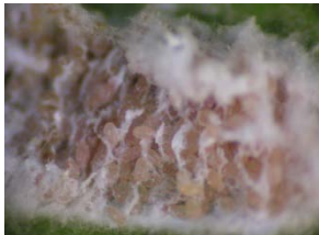
Figure 8. Camellia scale eggs ready to hatch.

applications of insecticidal soap or other insecticides labeled for crawler control.