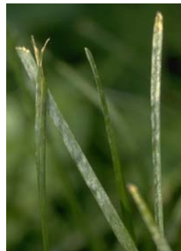
Figure 10. Powdery mildew on Kentucky bluegrass.

appear as though they have a coating of talcum powder (Figure 10). This powdery appearance is due largely to the presence of abundant microscopic fungal spores on the leaf surface. As the disease progresses, infected leaf blades turn yellow and then straw-colored as they die. This results in thinning of the sward.