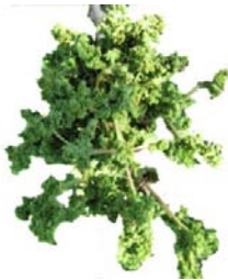
Figure 5. Mite-induced ash flower galls.

Female ash flower gall mites leave their wintering sites under bud scales or bark in the spring and move to developing male ash flowers. Their feeding stimulates formations of galls that make the flowers look like miniature grape clusters; these hard galls darken in late summer and stay on trees over the winter. Infestations do not affect tree health, only appearance.