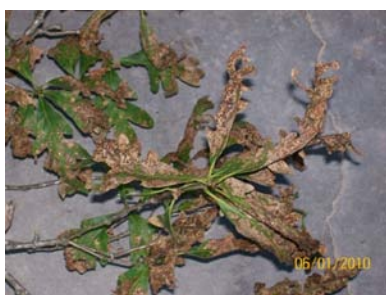
Figure 2. White oak leaves nearly dead from anthracnose disease. Jumping oak galls can be found as little dark spots within the anthracnose-caused dead areas on leaves.