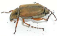
Figure 9. Rose chafer beetle.

Rose chafers occasionally arrive in the Insect ID Lab. These distinctive straw-colored insects with spiny orange-red legs are similar in some ways to the more familiar