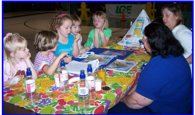
EFNEP Assistants teach pre-schoolers about the new Food Pyramid guidelines.

The Expanded Food and Nutrition Education Program (EFNEP) is a federally funded program conducted by Cooperative Extension Service using trained program assistants to seek out limited resource families. The families are taught lessons emphasizing four main areas: