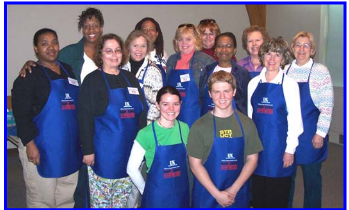
The first graduating class of the Master Food Volunteer Program, Fall 2005.

In support of good health the Master Food Volunteer Program held its first training session in March and April. It consisted of classes held on five consecutive Tuesdays from 9:00 a.m. to 3:30 p.m. One topic centered on basic nutrition with emphasis on its impact on diabetes and heart disease, which are two of the leading medical conditions in the state. Additional topics included were international foods, organic foods, and working with certain targeted populations.