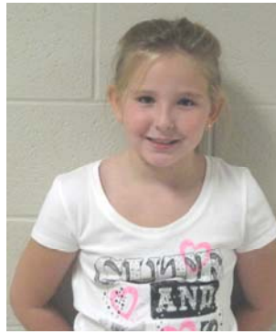
2010 Fall Coloring Contest Winner: