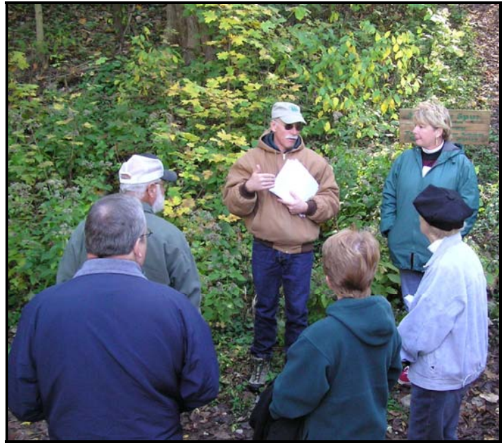
Master Gardeners learn about invasive plants on a trip to Cove Spring Park

Extension held the county’s first Extension Master Gardener program in the fall of 2007. Eighteen people completed the rigorous thirteen weeks of training. The topics consisted of botany, soils, pathology, pest management, entomology, fruits and vegetables, to name a few. After passing a comprehensive exam and completing 30 hours of volunteer service to the Extension program, the students become Certified Master Gardeners who join other Certified Master Gardeners to be an asset to Extension.