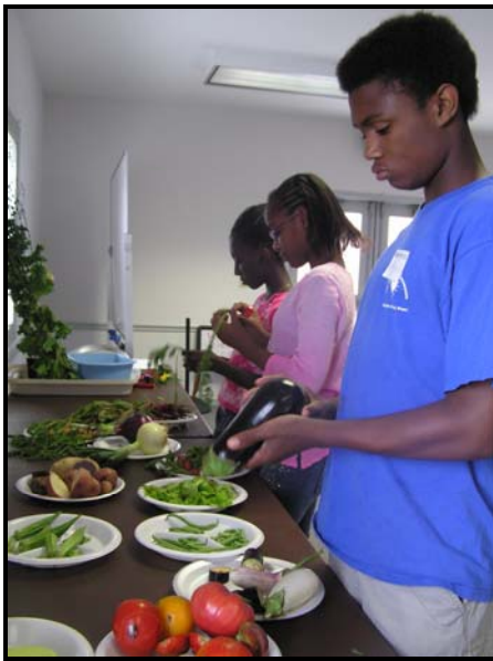
Kids learn about fresh vegetables at Cooking Camp

Franklin County Extension supports and advises the Franklin County Farmers Market. The Market Association had 28 members this season with 13 participating in the Farmers Market Nutrition program that supplies coupons to WIC and Senior recipients for purchase of fresh, local produce. The Market partnered with Kentucky State University Small Farms Program to hold a special 3 rd Thursday Thing program. Also the Market partnered with the Chamber of Commerce to host an Ice Cream Social for the Frankfort Community.