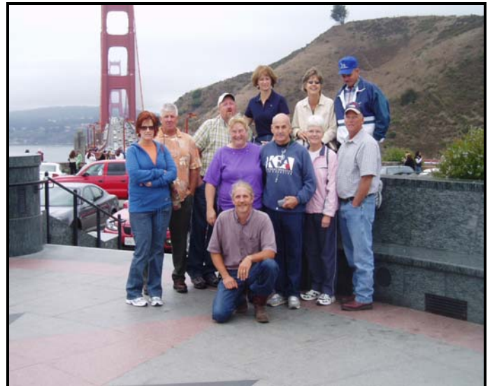
Cattlemen's Education Tour to Northern California

Many improvements have been made to the farmscape due to government programs (NRCS State Cost share, EQIP, WHIP, Phase I, etc). These cost-sharing opportunities have allowed farmers and landowners to make short and long term improvements such as diversification into vegetables, fruits, horses, goats and sheep; cattle handling, feeding, watering and breeding; soil fertility; fencing; pasture species, woodland to name a partial list.