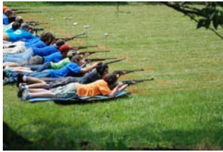
Our Shooters at work.

Anyone seeking alternative opportunities for leadership and interpersonal skills development