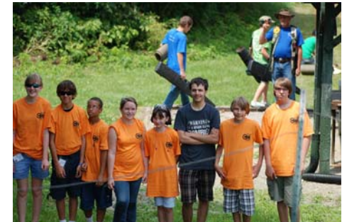
Fayette County Competition Shooters