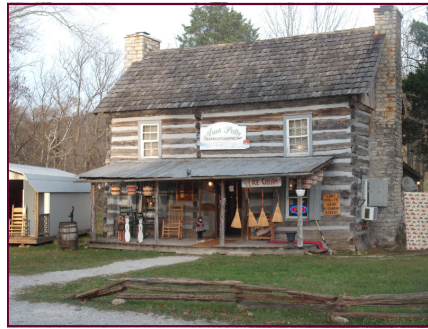
A COOL spot for some ice cream in Renfro Valley