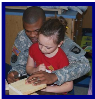
Father and Daughter completing a woodworking activity at Lincoln Family Fun Night

A Family Fun night was held at Lincoln Elementary at Fort Campbell Army Installation. The 65 youth and their families have a chance to choose from muffin mix, Building Bridges Communication, scrapbooking, GAK, leather, woodworking and learning about 4-H shooting sports. Families say that working together on projects is a great way to develop communication and have fun. Military children at South Christian School completed the 4-H Building Bridges, Family Connections Communication curriculum. By completing scrapbook pages, the students, who all had a parent deployed to Iraq, learned they all had things in common. The students brought family photos and talked about their families and shared experiences.