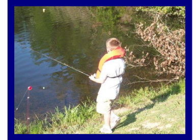
Camper Fishing at Natural Resource Camp

Campers can select from such classes as nature, ropes, recreation, canoe, horse, rifle, archery, fishing and even classes such as line dancing, rocketry, cheerleading, drama and crafts. Boys and girls from Christian County also attend 4-H camp as part