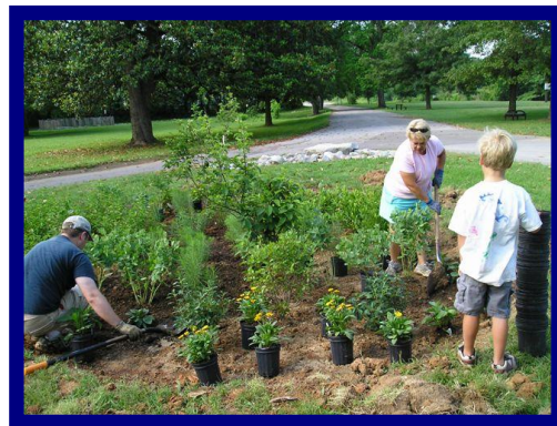
Planting of a Rain Garden at Jeffers Bend

Although most people never think about stormwater, about half of the pollution that stormwater carries comes from things we do in our yards and